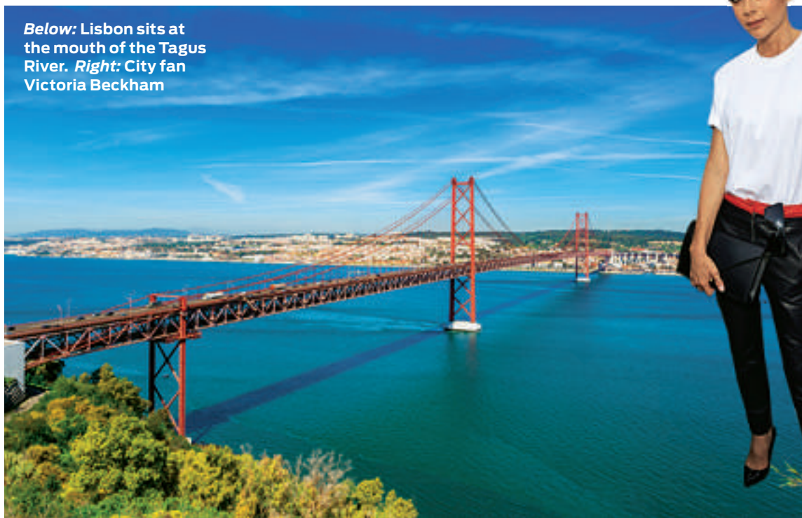
Below: Lisbon sits at the mouth of the Tagus River. Right: City fan Victoria Beckham