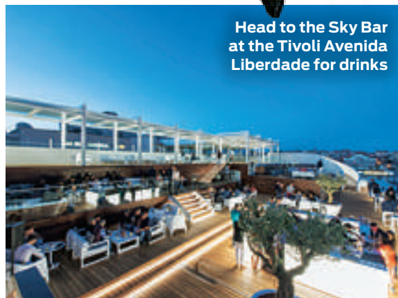
Head to the Sky Bar at the Tivoli Avenida Liberdade for drinks

century-old lift that fits just three people.