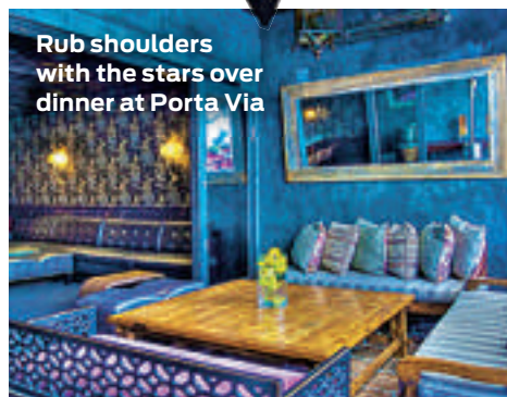
Rub shoulders with the stars over dinner at Porta Via

There isn't enough room to list all the famous faces you