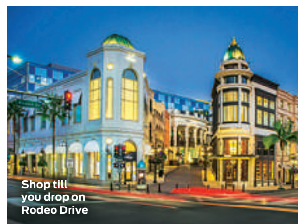
Shop till you drop on Rodeo Drive