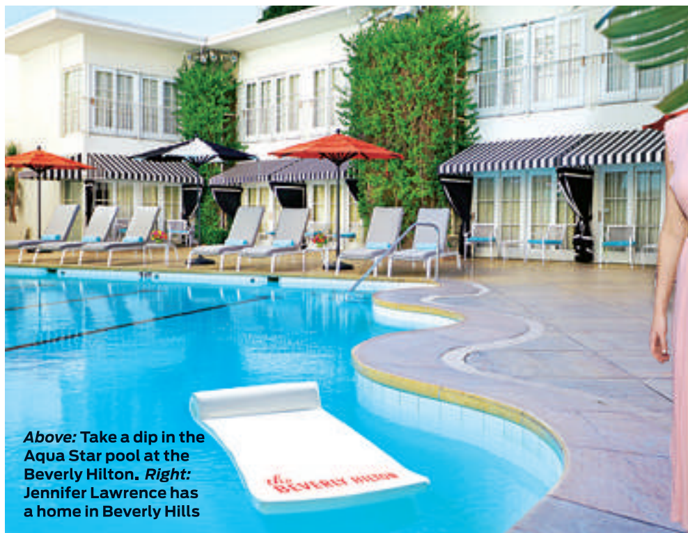
Above: Take a dip in the Aqua Star pool at the Beverly Hilton. Right: Jennifer Lawrence has a home in Beverly Hills

WITH THE OSCARS COMING UP, STAR-STUDED BEVERLY HILLS IS THE ONLY PLACE TO BE